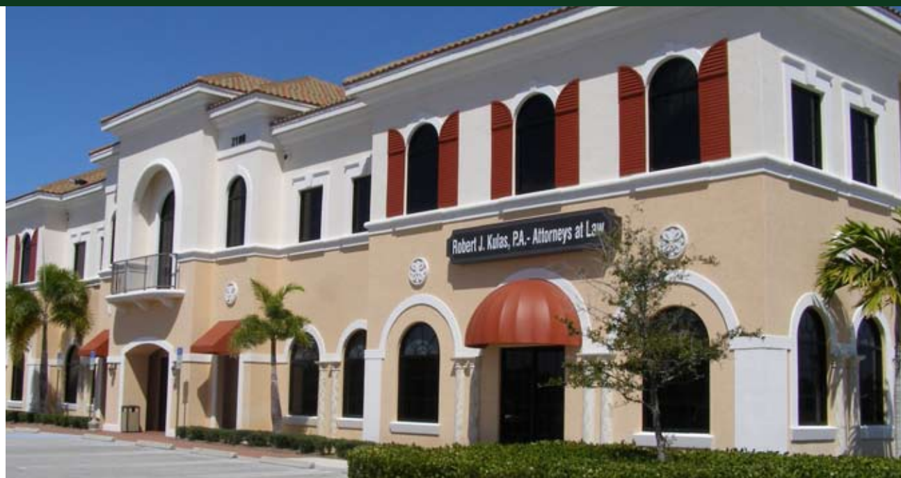
East Lake Village Professional Center 2100 S.E. Hillmoor Drive, Unit 202, Port St. Lucie, Florida